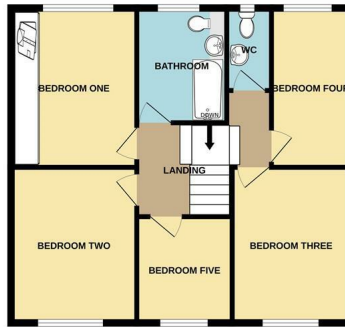
1ST FLOOR 670 sq.ft. (62.3 sq.m.) approx.